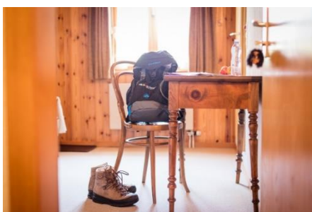
New rooms with alpine charm