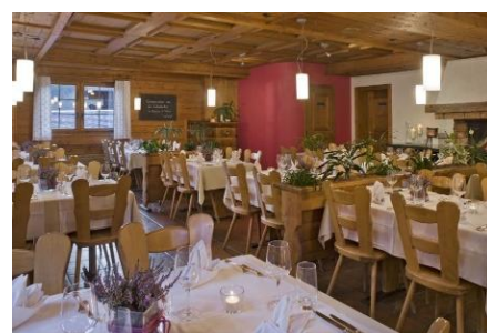
Restaurant, gourmet – half board

Further press photos for free use: Flickr photo download