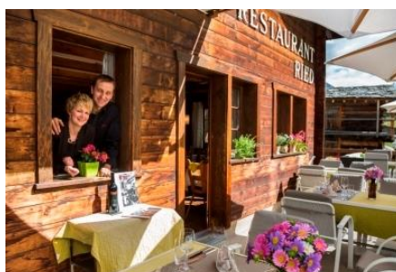
Your hosts