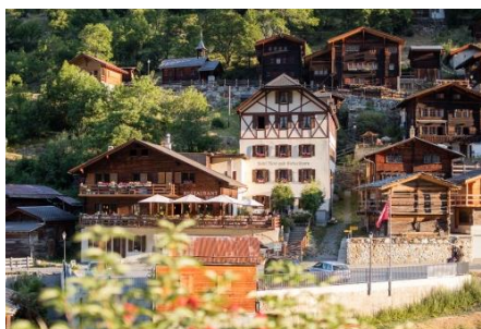
Timbered: Hotel, Chalet: Restaurant